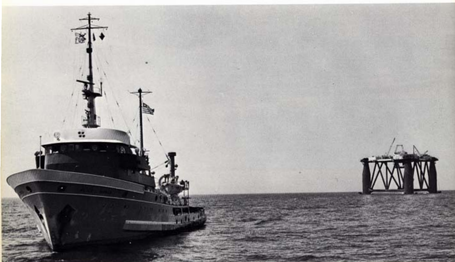
5,200-MILE-TOW — The Alice L. Moran completed a 5,200-mile tow of the world's largest offshore submersible drilling rig last Fall. The Sedco 135E, owned by Southeastern Drilling Inc. of Dallas, Texas, was towed by the world's most powerful tug from Hiroshima, Japan to Portland, Australia. The triangular-shaped drill rig has a deck measuring 340 feet long on each side and operates at a normal draft of 24 feet with the deck 160 feet above the surface of the water. Under severe weather and sea conditions the Sedco 135E can submerge an additional 65 feet for added stability and safety. The 9,600-brake-horsepower Alice L. Moran has a cruising range of over 15,000 miles and operates throughout the world.

A short history of the Vineyard Haven Bethel, seamen's home established in 1893 by the Boston Seaman's Friend Society, has been issued. It is on Martha's Vineyard, off the coast of Massachusetts, an island well known to coastwise tug men. During storms in the olden days, as many as 30 tugs used to tie up at the ferry pier near the Bethel. Since each would have had four or five barges at anchor in the harbor, it is easy to imagine how crowded Vineyard Haven Bay would have been. Among its distinctive features, the Vineyard Haven Bethel has its own cemetery. A Dutch boy from a Norwegian tug, the Tarus , was the first to be buried there many years ago.