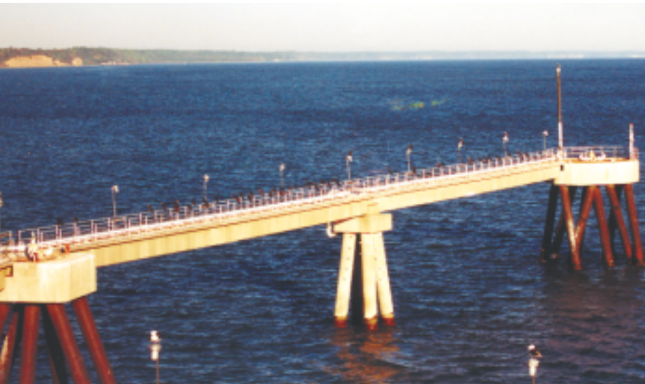
Photo of pier end at Cove Point, Maryland, illustrates its distance offshore.

pects Dominion's Cove Point Terminal, even when there is no tanker at the pier. Despite the public implications of such high-security treatment, maritime shipments of LNG cargoes have proven to be remarkably accident free. More than 33,000 LNG carrier voyages have been completed around the globe in the past 40 years or so, without significant accidents, fires or explosions, according to industry reports.