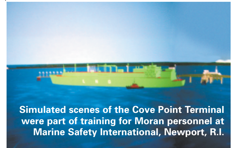
Simulated scenes of the Cove Point Terminal were part of training for Moran personnel at Marine Safety International, Newport, R.I.

MORAN’s newest tug, Kaye E. Moran , has been outfitted with the most modern firefighting equipment, including water pumping capacity of close to 11,000 gpm through two deck monitors aft of wheelhouse.