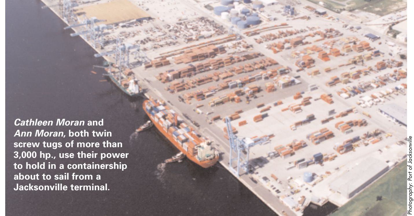
Cathleen Moran and Ann Moran, both twin screw tugs of more than 3,000 hp., use their power to hold in a containership about to sail from a Jacksonville terminal.